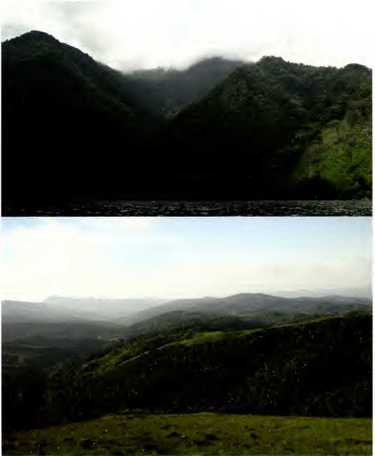
Fig. 1. Above – View of Misotschi-Kabogo foothills from Lake Tanganyika. Note mature forest next to degraded patch near village. Below – Mosaic of forest and grassland as seen from summit of Misotschi-Kabogo escarpment.